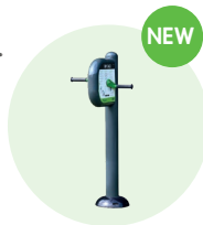
Resistance Arm Bike (Accessible)