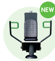
Resistance Seated Row