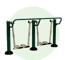
Double Air walker